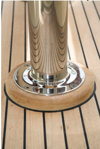
Stainless steel table legs in cockpit

Some standard Friendship 40 detail photos: