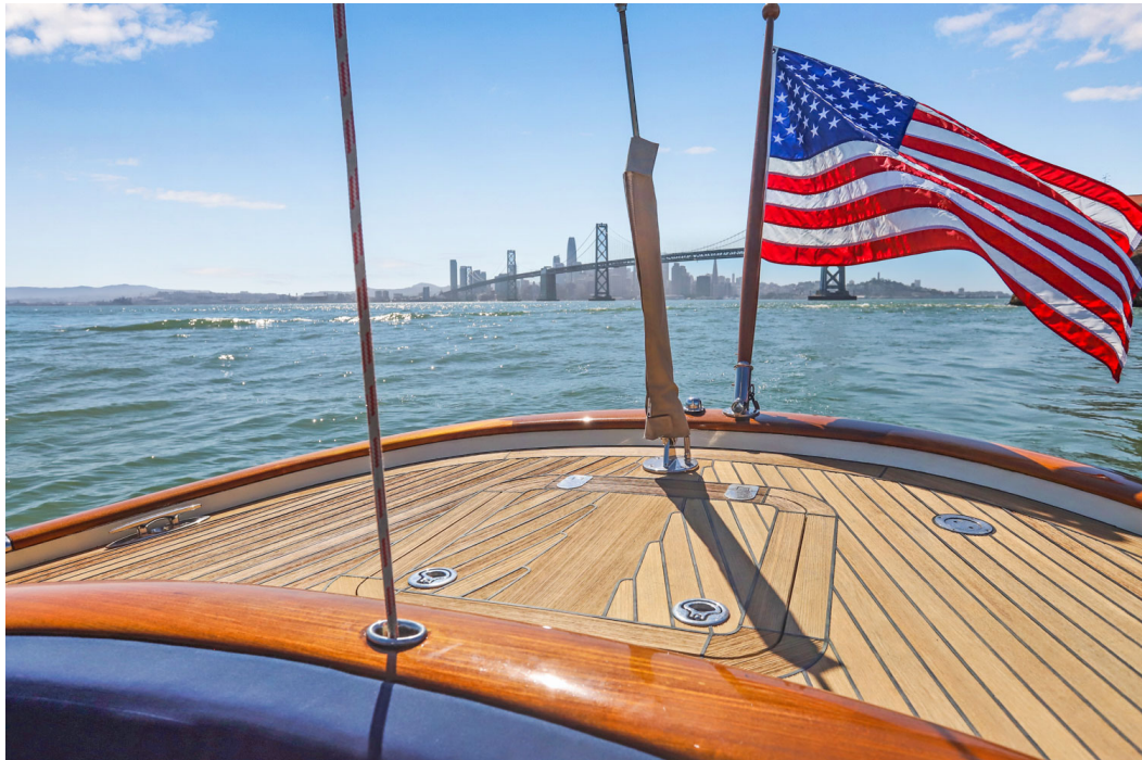
Aft deck – stainless steel flag socket, stainless steel hydraulic backstay, and flush plate for fresh water hot/cold deck shower

SCRAM is available immediately, an incredible value without having to wait the standard 12-month build period for a new Friendship 40. It is a rare find, a Friendship 40 on the used market, and a testament to how well these yachts hold their value. There are boats and there are yachts. The Friendship is built for those who know the difference.