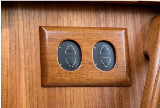
Dimmer switches for boom lights