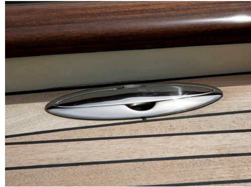
"Unstubbable" flush cleats