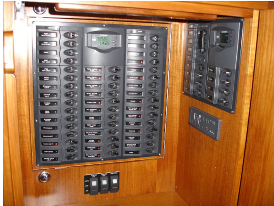
Hidden electrical panel