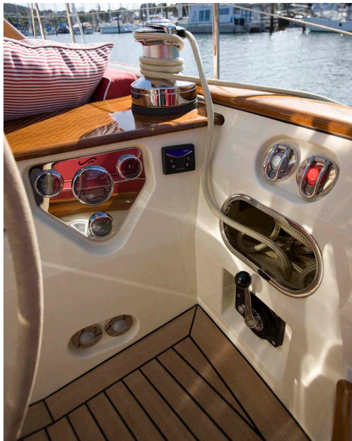
To starboard of wheel: engine panel and genoa furler buttons