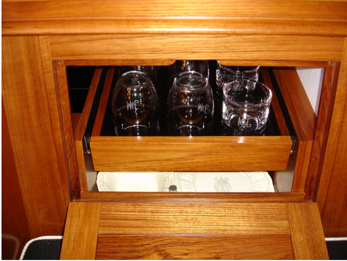
Custom dish storage