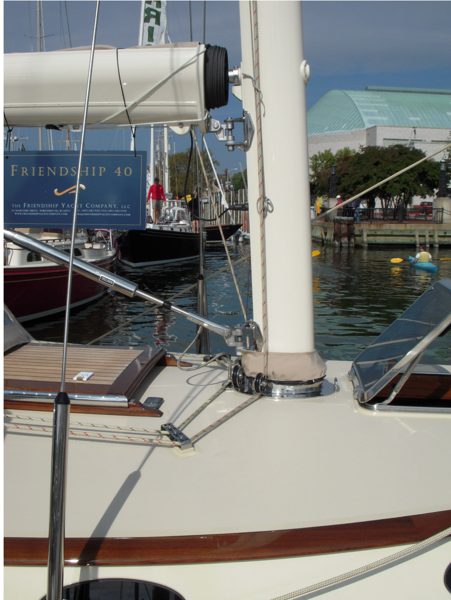
Stainless steel hydraulic vang, in-boom main furler, and mast collar with custom built-in stainless steel turning blocks.

The two secondary winches on the house top provide push button control of centerboard pennant, spinnaker halyard, main halyard and preventer. All lines have flush, stainless steel lined bins for clutter-free storage. All four deck winches are stainless steel Lewmar two-speed electric.