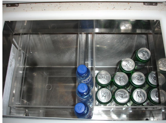
Removable shelving in fridge