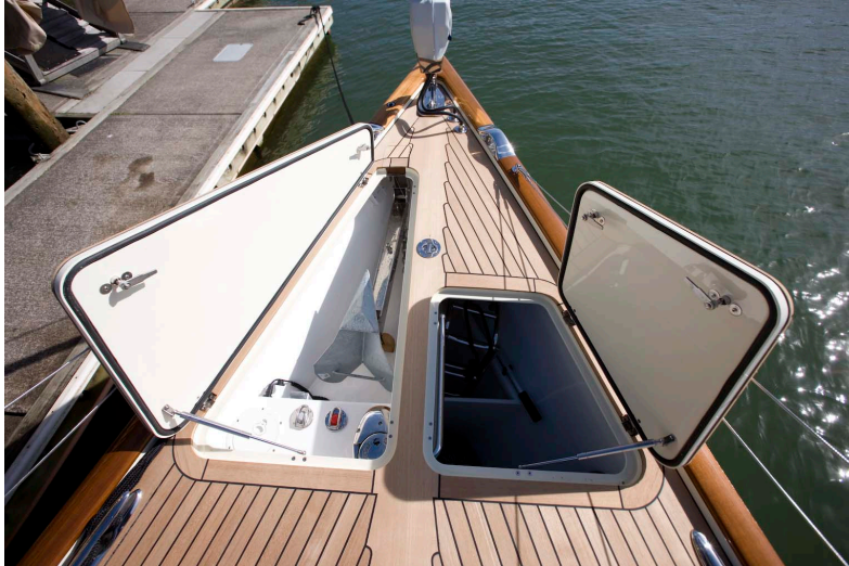
Anchor swing out system to port, chain locker and large storage to stbd.

The foredeck houses two flush lockers – to port is the swing out anchor system with Lewmar electric windlass and salt water wash down, to starboard is the chain locker with storage for swim ladder and dinghy outboard motor. The custom chocks in the caprail are larger on the foredeck than those aft to accommodate large mooring lines, and the cleats are flush to the deck when not in use. On centerline is an additional, extra strength pop-up padeye for hurricane tie down. The flush hatch on the foredeck is located directly over the berth.