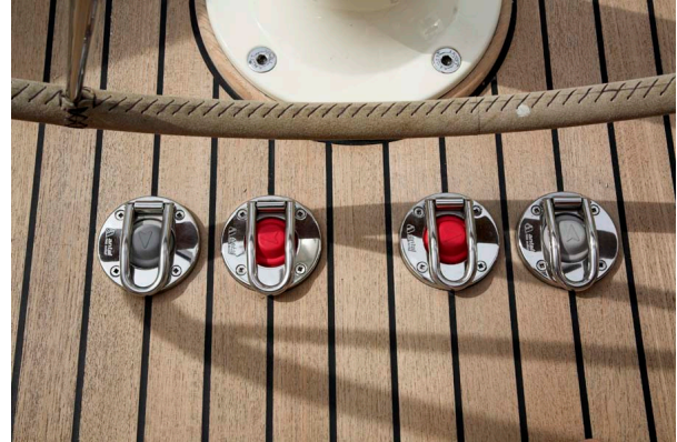
At foot of helmsman: mainsheet and bowthruster control

The hydraulic mainsheet system of the Friendship 40, controlled by two foot buttons at the helm, brings new levels of ease to sailing. All sail handling is done using push buttons located within finger's reach from the helm seat. A Reckman electric headsail furler effortlessly controls the jib using two foot buttons at either side of the helm. The bowthruster is also controlled by two foot buttons located at the base of the wheel.