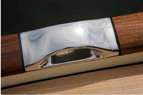
Custom cast stainless steel chocks