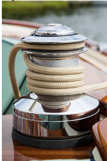
Electric Lewmar winches