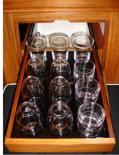
Pull-out shelf for glasses