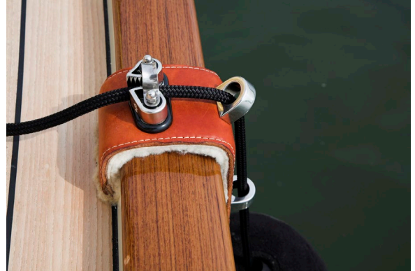
Custom leather and lambskin fender holders