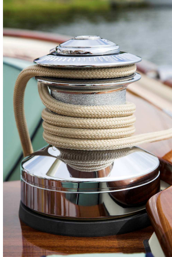
Electric Lewmar winches