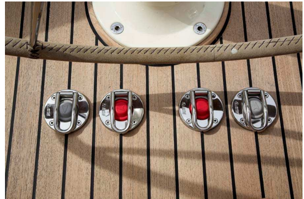
At foot of helmsman: mainsheet and bowthruster control

The hydraulic mainsheet system of the Friendship 40, controlled by two foot buttons at the helm, brings new levels of ease to sailing. All sail handling is done using push buttons located within finger's reach from the helm seat. A Reckman electric headsail furler effortlessly controls the jib using two foot buttons at either side of the helm. The bowthruster is also controlled by two foot buttons located at the base of the wheel.