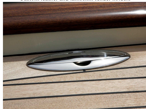
"Unstoppable" flush cleats