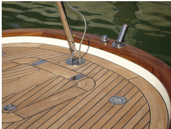
Aft deck – stainless steel flag socket, stainless steel hydraulic backstay, and flush plate for fresh water hot/cold deck shower

SUSAN ELIZABETH is available immediately, an incredible value without having to wait the standard 12-month build period for a new Friendship 40. It is a rare find, a