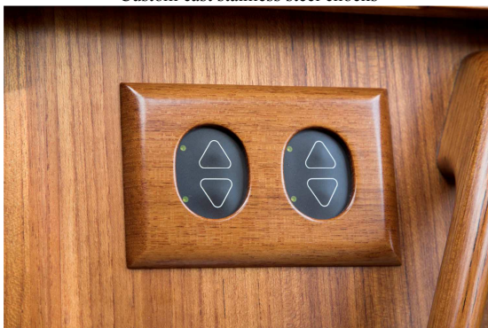
Dimmer switches for boom lights