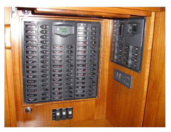
Hidden electrical panel