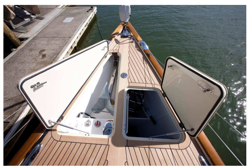
Anchor swing out system to port, chain locker and large storage to stbd.

The foredeck houses two flush lockers – to port is the swing out anchor system with Lewmar electric windlass and salt water wash down, to starboard is the chain locker with storage for swim ladder and dinghy outboard motor. The custom chocks in the caprail are larger on the foredeck than those aft to accommodate large mooring lines, and the cleats are flush to the deck when not in use. On centerline is an additional, extra strength pop-up padeye for hurricane tie down. The flush hatch on the foredeck is located directly over the berth.