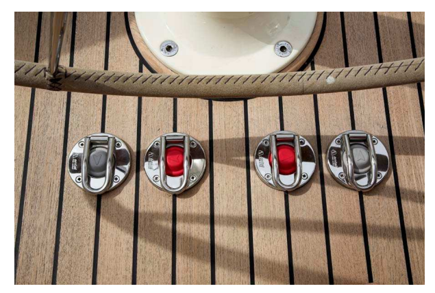
At foot of helmsman: mainsheet and bowthruster control

The hydraulic mainsheet system of the Friendship 40, controlled by two foot buttons at the helm, brings new levels of ease to sailing. All sail handling is done using push buttons located within finger's reach from the helm seat. A Reckman electric headsail furler effortlessly controls the jib using two foot buttons at either side of the helm. The bowthruster is also controlled by two foot buttons located at the base of the wheel.