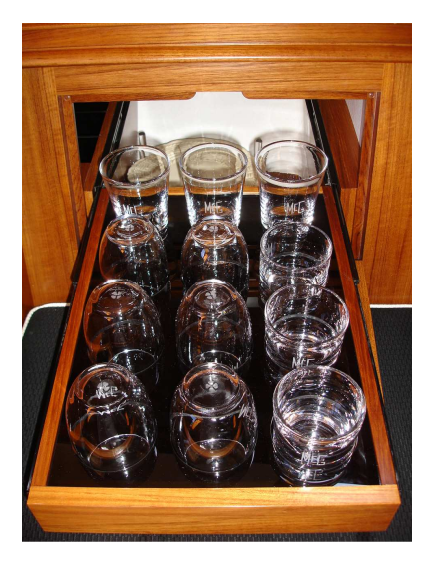
Pull-out shelf for glasses