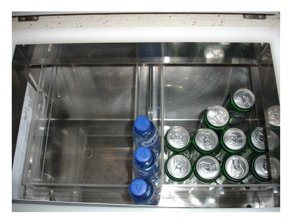
Removable shelving in fridge