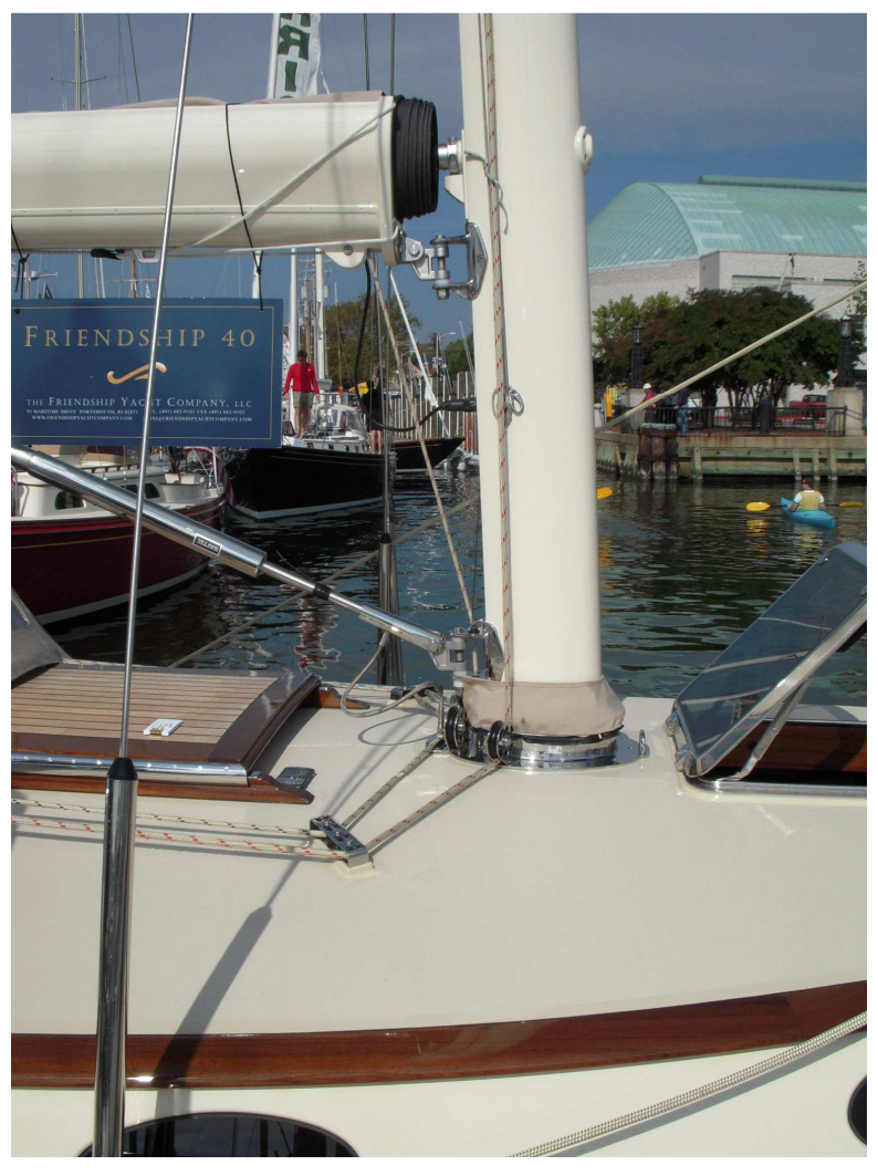
Stainless steel hydraulic vang, in-boom main furler, and mast collar with custom built-in stainless steel turning blocks.

The two secondary winches on the house top provide push button control of centerboard pennant, spinnaker halyard, main halyard and preventer. All lines have flush, stainless steel lined bins for clutter-free storage. All four deck winches are stainless steel Lewmar two-speed electric.