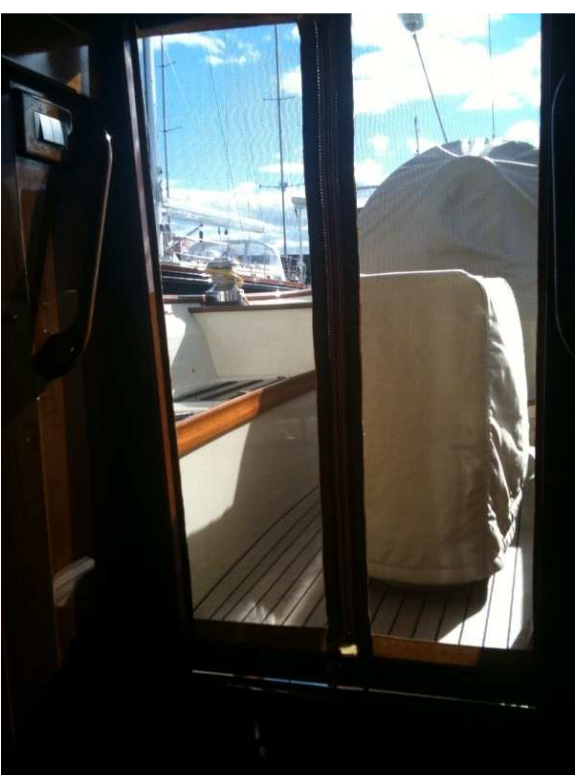
Custom zippered bug screens for companionway