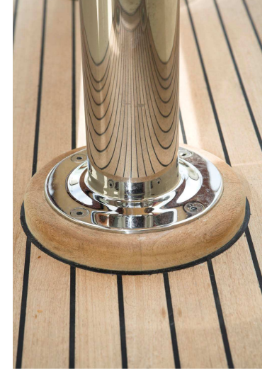
Stainless steel table legs in cockpit

Some standard Friendship 40 detail photos: