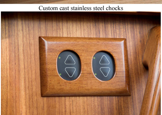
Dimmer switches for boom lights