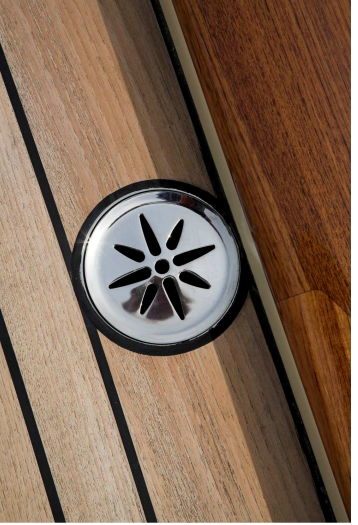
Custom stainless steel scuppers