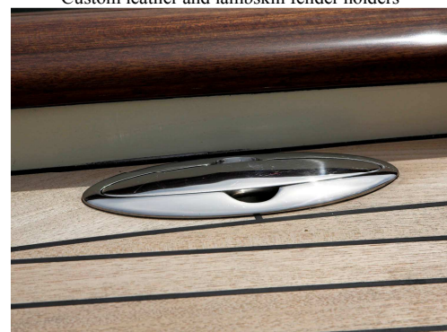
"Unstubbable" flush cleats