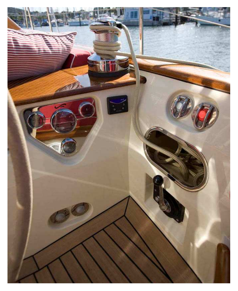
To starboard of wheel: engine panel and genoa furler buttons