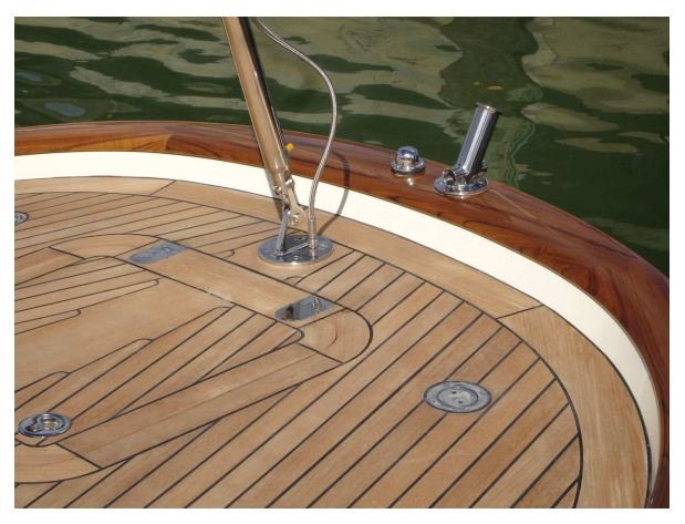
Aft deck - stainless steel flag socket, stainless steel hydraulic backstay, and flush plate for fresh water hot/cold deck shower

WICKED is available immediately, an incredible value without having to wait the standard 12-month build period for a new Friendship 40. It is a rare find, a Friendship 40 on the used market let alone the youngest one of the fleet. She is a testament to how well