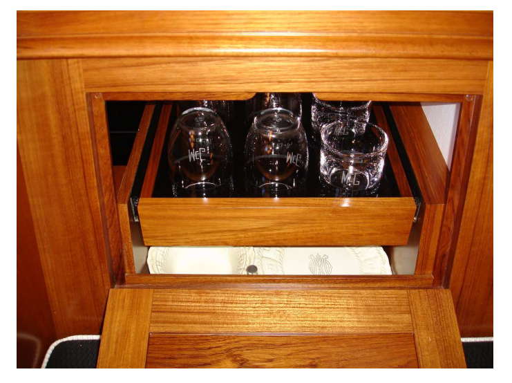
Custom dish storage