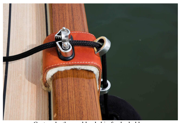
Custom leather and lambskin fender holders