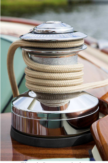
Electric Lewmar winches